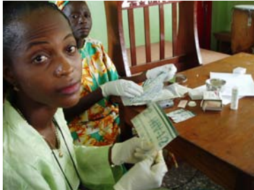
A tester in Ogbomoso with the Determine® test kit

The mass rapid testing started in Ogbomoso Baptist Medical Centre, Oyo State on May 12, 2006. The awareness by the community brought out people who wanted to be tested.