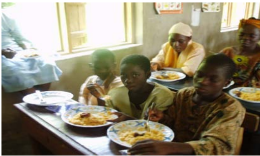
Some Children Eating During the Orphans Day

Stakeholders that participated include doctors and other key health care personnel from 14 hospitals and clinics