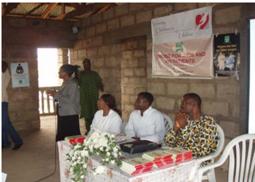
Speaker and Participants at the Stakeholders Meeting