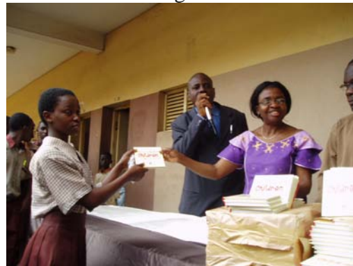
Distribution of HIV/AIDS Awareness Book in Lagos Secondary School

A survey was conducted in some schools in June 2007 to assess the effectiveness of the literature and previous visits on HIV/AIDS knowledge and awareness.